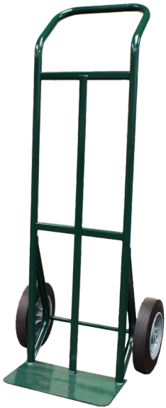
Continuous Flow Handle

Envision hand trucks can be relied upon to handle the heaviest loads and last for years.